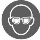
Wear eye protection